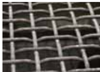
Tufflex Wire Screening Media.

Tufflex wire is manufactured with a proprietary process that creates a higher tensile strength. Elongated, fine grains in the wire decrease surface rust and corrosion. Tufflex wire provides more ductility and is less susceptible to breakage.