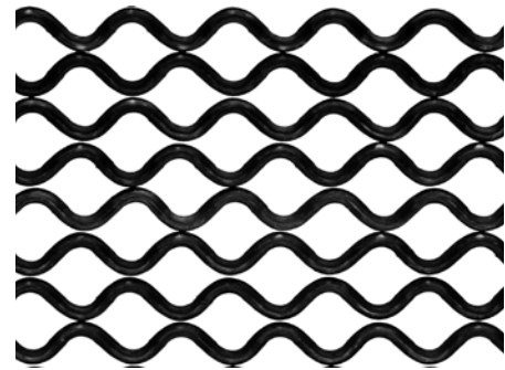
D - (Diamond) Style

D - Style have wires that vibrate independently of each other. D - Style screens will provide a higher production rate in moderate screening applications.