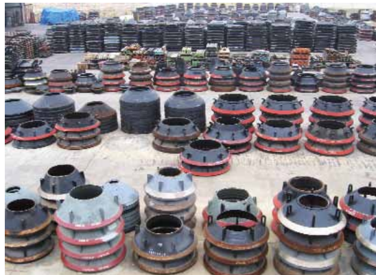
Partial - West Coast Manganese Yard