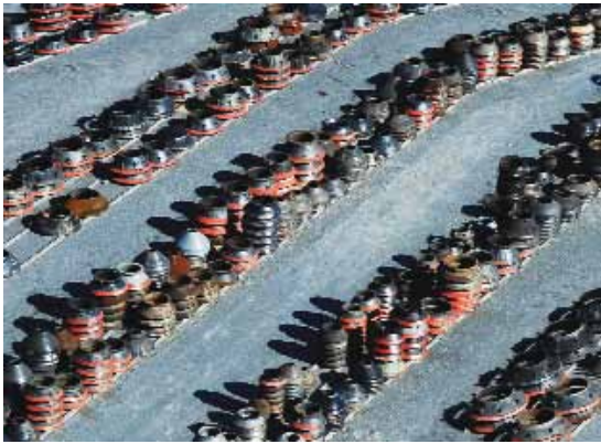
Partial - East Coast Manganese Yard