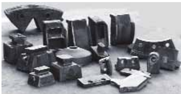
Various VSI Wear Parts

Impact wear parts can be customized upon request.