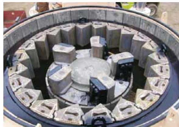
VSI Wear Table