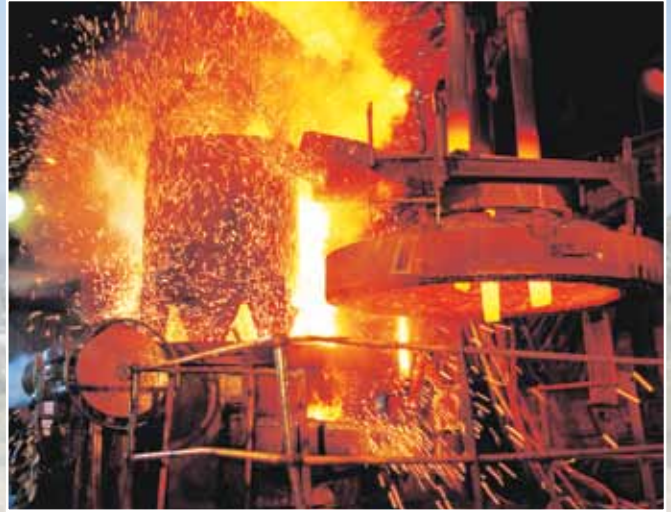
Crusher Wear Parts