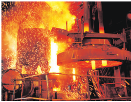
Crusher Wear Parts

Of course they will also have their Wire Cloth, Polyurethane and Rubber screening media and Crusher Wear Parts, but they will also be showing some new things that Quarries and Mines have been seeking, to help increase their plant productivity.