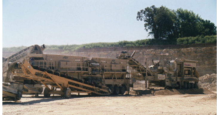
Yahara, Triple Deck – Portable Plant.

Increasing production and maximizing throughput is nothing new. In fact, next to sizing accuracy a recent survey shows that throughput is the second largest concern amongst producers when surveyed to rank the factors most important when selecting screening media. But what happens when external factors such as market growth and adverse weather conditions impact your operations ability to meet the increasing demand and capture your share? Here's how one producer teamed with his local screening and crushing field specialist.