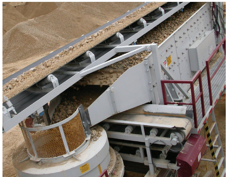
Portable Crushing Plant.

Yahara Materials operates seven 6 x 20, triple deck, portable crushing plants that were equipped with slotted, Tri-Lock screens. These slotted screens became very problematic when faced with ever-changing soil conditions found at various locations; due to increased moisture content present during the winter and spring months. They were unable to remove enough fines to get the product within specification. The slotted screens would blind over, halting production and minimizing throughput.